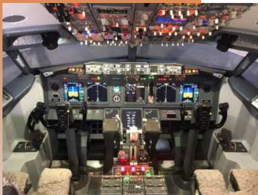
Cockpit at Extreme Flight Simulation